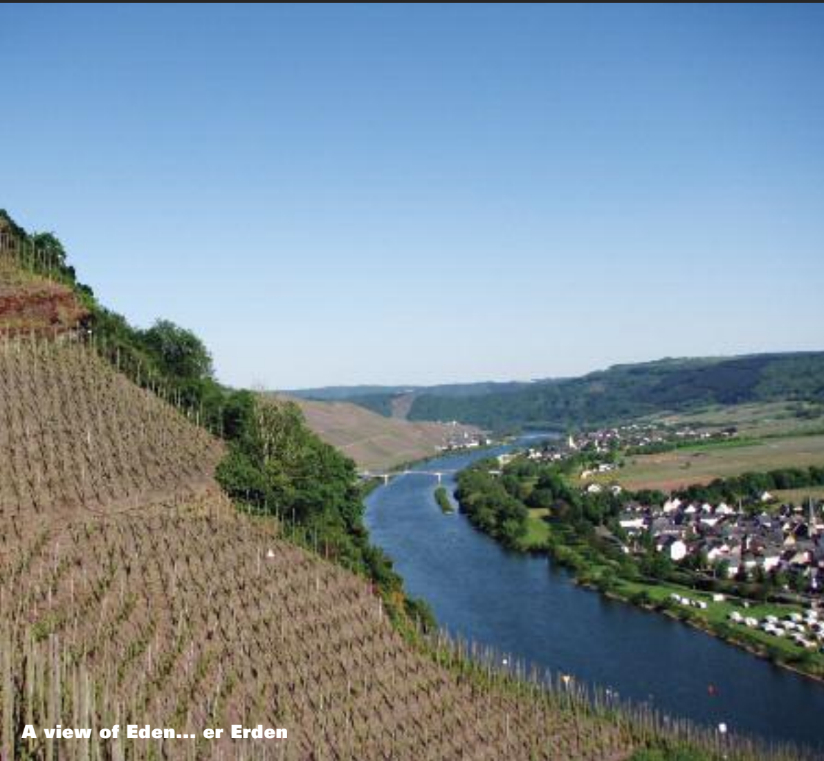
A view of Eden... er Erden